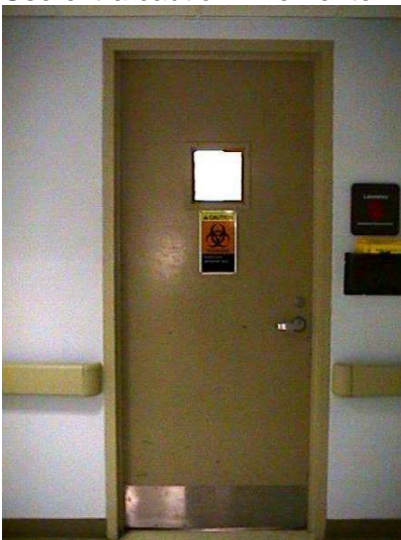
Door with a Biohazard Sign

Use extra caution when entering a biohazard area.