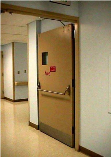
Fire and Smoke Doors

Know the location of the nearest fire extinguisher, pull station, exit, and red emergency power outlets in your work area. Do not block fire and smoke doors.